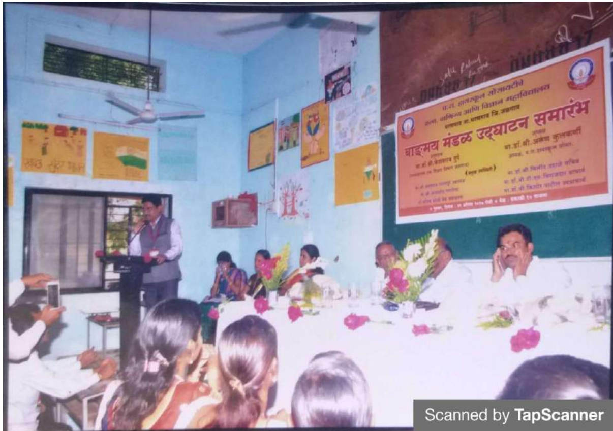
Inauguration Ceremony of Arts Circle

The following programs organized by literally association in the last five years -